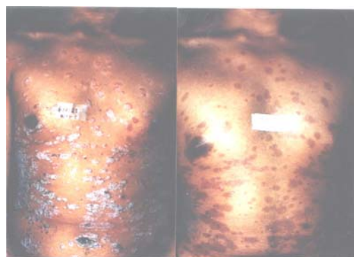
Figure 2 Psoriatic plaque before and after treatment with PUVB therapy

The median cumulative dose required for clearance was 19.4 J/cm 2 (Table 2). One patient with 30% improvement, another with 20% improvement and two patients with very mild improvement were declared resistant.