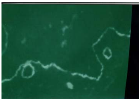
Figure 2 Linear IgA deposits at dermo-epidermal junction in LAD