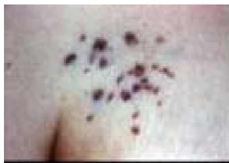
Figure 3 A 9-year-old boy with superficial venous malformation of left anterior axillary fold.

A 12-year-old girl was referred with biopsy proven venous malformation on the