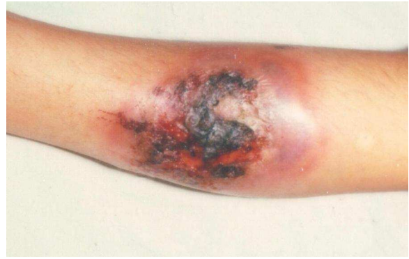
Figure 1 An ulcerated plaque with necrotic tissue and crusts on forearm.

Laboratory data White blood cell count (WBC) = 31000/mm 3 with polys=80% and lymphocytes=20%, hemoglobin (Hb)=12.7, erythrocyte sedimentation rate (ESR) for first