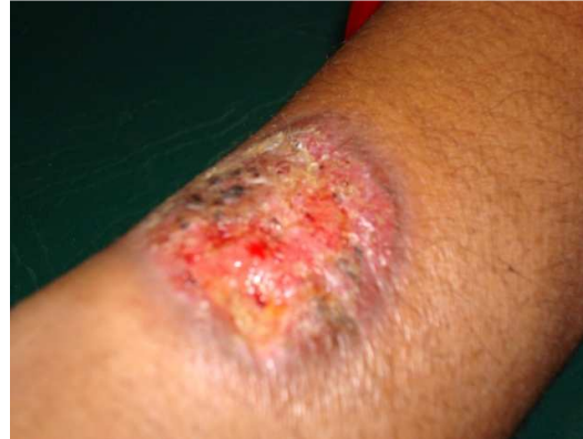
Figure 1 Ulcerated and crusted plaque in right forearm.

Skin biopsy for histopathology showed neutrophilic abscess in the deep dermis surrounded by mixed inflammatory infiltrate