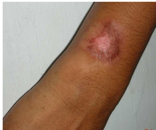
Figure 3 lesion completely healed with scarring.