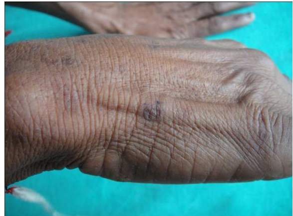
Figure 4 Classical lesion of disseminated superficial actinic porokeratosis showing hyperkeratotic ridge with furrow and central atrophy over dorsum of hand.