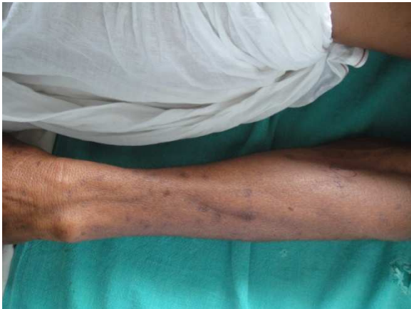
Figure 3 Lesions of disseminated superficial actinic porokeratosis over dorsum of forearm.