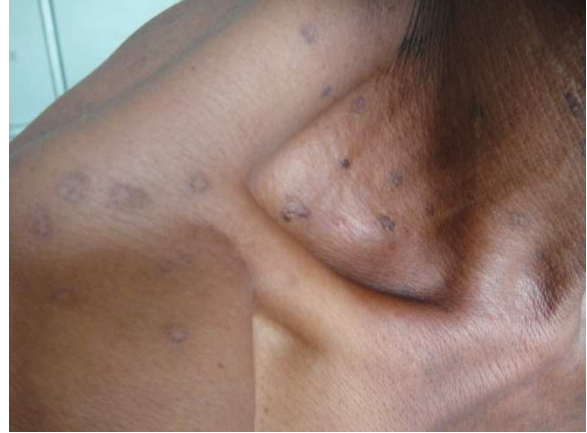
Figure 2 Lesions of disseminated superficial actinic porokeratosis over neck and shoulder.