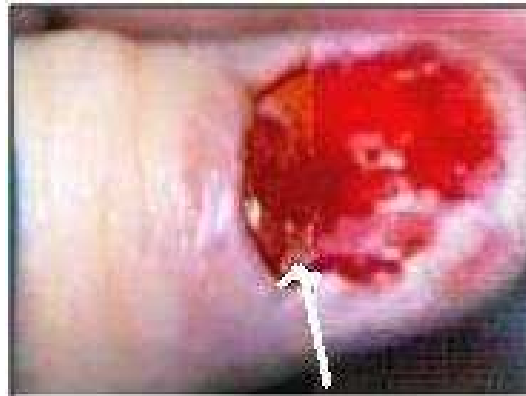
Figure 2 Glomus tumor (white arrow) as seen after removal of nail-plate.

(digital block) with 1% xylocaine with proximal tourniquet control. Through transungual approach, 0.5cm x 0.5cm shiny, pinkish, encapsulated lesion was found arising from nail bed ( Figure 2 ). This lesion was excised in toto. Histopathological analysis of the lesion confirmed the diagnosis of benign