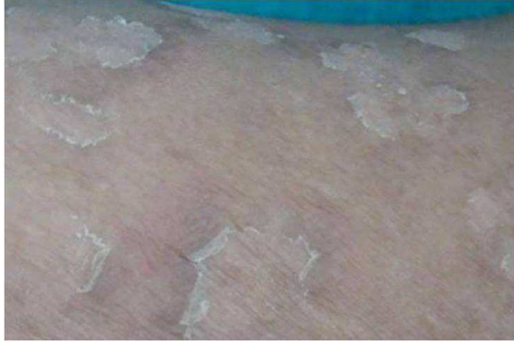
Figure 1 Typical mauserung phenomenon