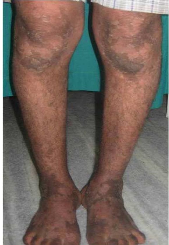
Figure 2 Peeling of skin with flexural dirty grey hyperkeratosis with typical rippled pattern on anterior aspect of leg and knees.