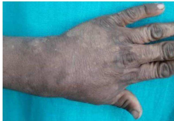
Figure 4 Peeling of skin from dorsum of hand.

childhood and no information could be obtained about his parents. He was accompanied by two social workers of his orphanage who were unaware about detailed history of his illness.