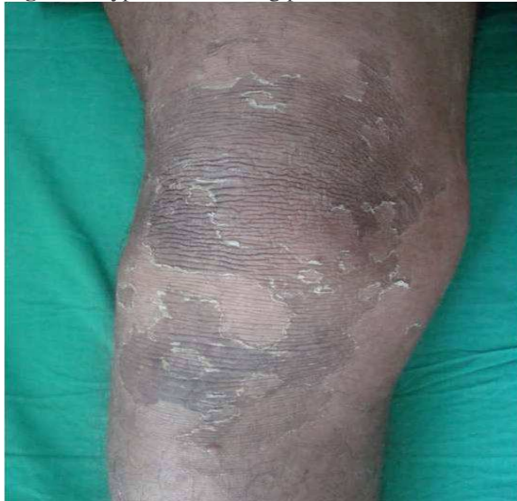
Figure 3 Peeling of skin and hyperkeratosis in rippled pattern on knee.