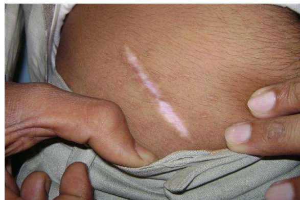
Figure 2 Depigmentation over appendectomy scar.

occurrence of a new, unrelated disease that appears at the same location as a previous disease; hence "isotopic" means "at the same place". 4 Our patient developed alopecia areata over the vitiliginous patch on the neck at the posterior aspect of hairline suggesting an isotopic response. Previous case reports have described isotopic response in context of herpes simplex and herpes zoster. The second disease which have been reported are granuloma annulare, comedones, xanthoma, genital warts,