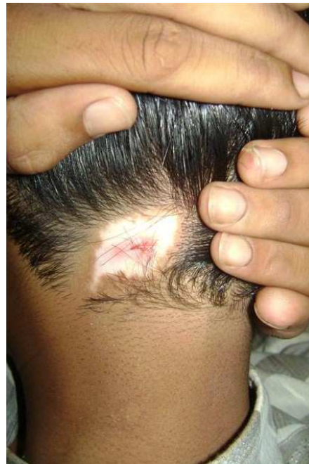
Figure 1 A vitiliginous patch with alopecia.

The term "isotopic response" describes the