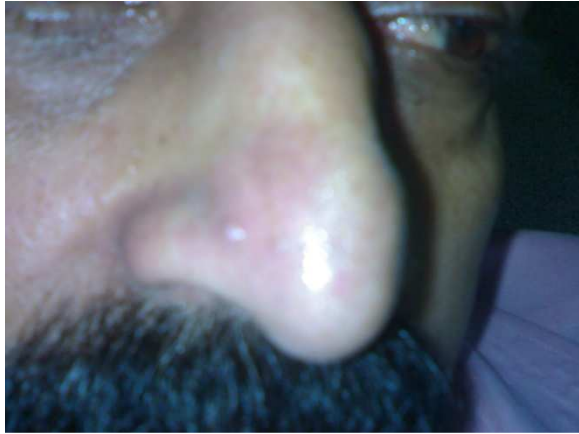
Figure 1 A skin-coloured nodule on nose.