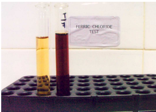
Figure 2 Urine examination by ferric chloride test.