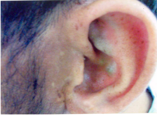
Figure 1 Greyish-blue pigmentation of left ear.